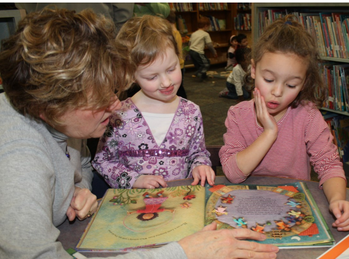
Laying the foundation for learning and reading.