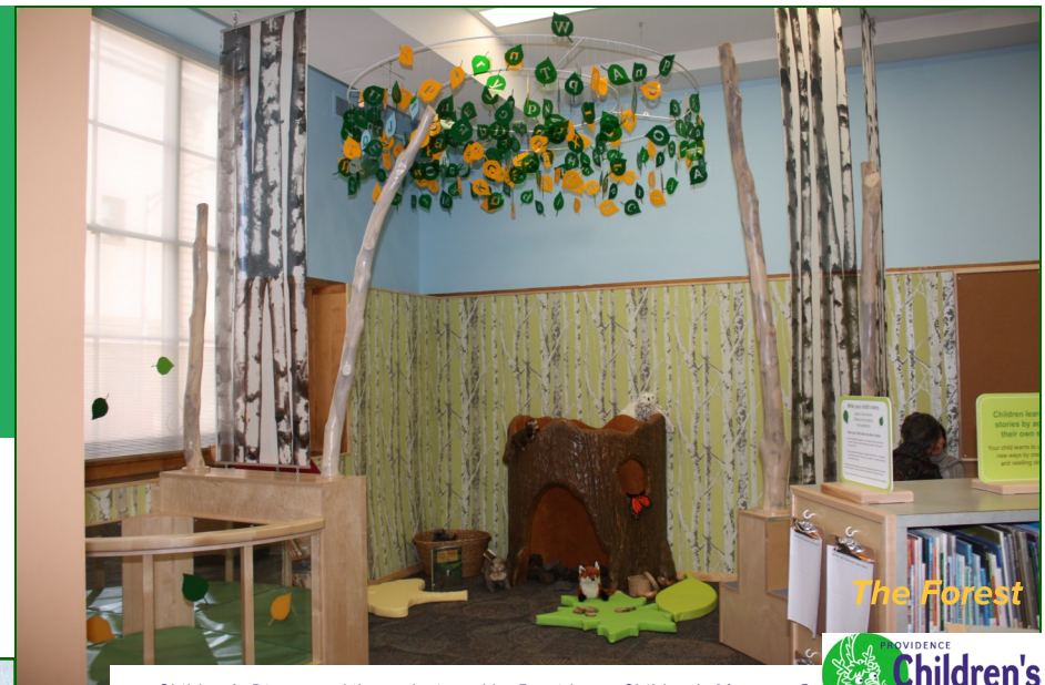
Children's Discovery Library designed by Providence Children's Museum ©