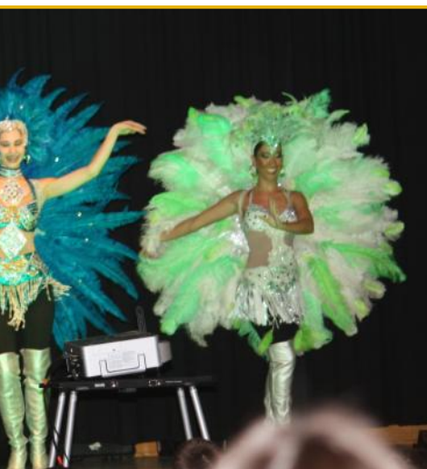
The Hispanic Flamenco Ballet performed on our Auditorium Stage in November.

Families were kept busy this year with a full schedule of Summer Reading activities and programs, Bright Night performances, and monthly Sunday Family Learning programs, in addition to an expanded schedule of early childhood learning programs. We welcomed nearly 6,800 children and families to early childhood, youth and family learning programs throughout the year.