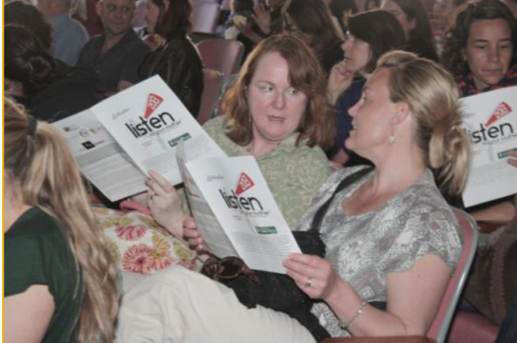
Above: Listen to Your Mother: Providence audience members got a great show. Below: We welcomed the Fulbright Scholars in March for research using our Special Collections. Bottom: The long-running HiFi Writers continued their regular meetings at PPL throughout the year.

We held a number of collaborative program series, including a Let's Talk About It: Making Sense of the American Civil War , a five-part reading and discussion series developed by the American Library Association and National Endowment for the Humanities with local support by the Rhode Island Council for the Humanities. We partnered with Cranston and East Providence Public Libraries with more than 100 participating from the three libraries.